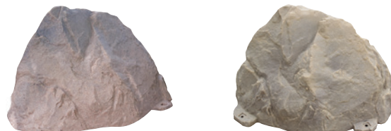
RB - Riverbed