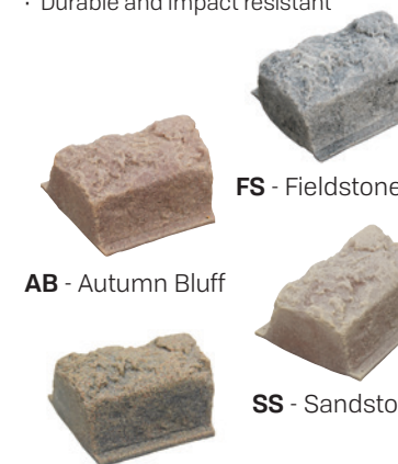
RB - Riverbed