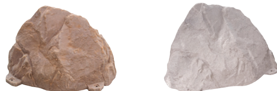
AB - Autumn Bluff