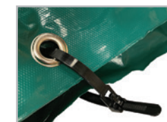
HD reusable fastener included with every pouch.