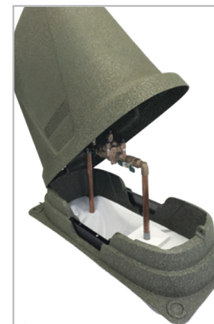
Includes stakes, anchors and metal vents.

Dimensions: 48"L x 17"W x 27½"H Weight: 25 lbs