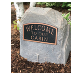
115 Rock with 653H-L-CB Address Plaque