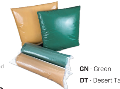
GN - Green DT - Desert Tan