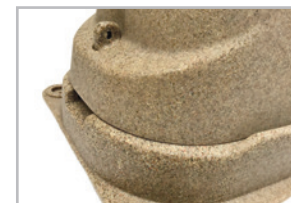
Hasp closure for lock or zip tie.

Dimensions: 34½"L x 16½"W x 26½"H Weight: 15 lbs